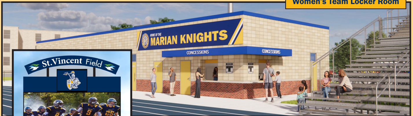
Women's Team Locker Room

WHAT WILL YOU DO TO HELP STUDENTS REALIZE THEIR DREAMS!