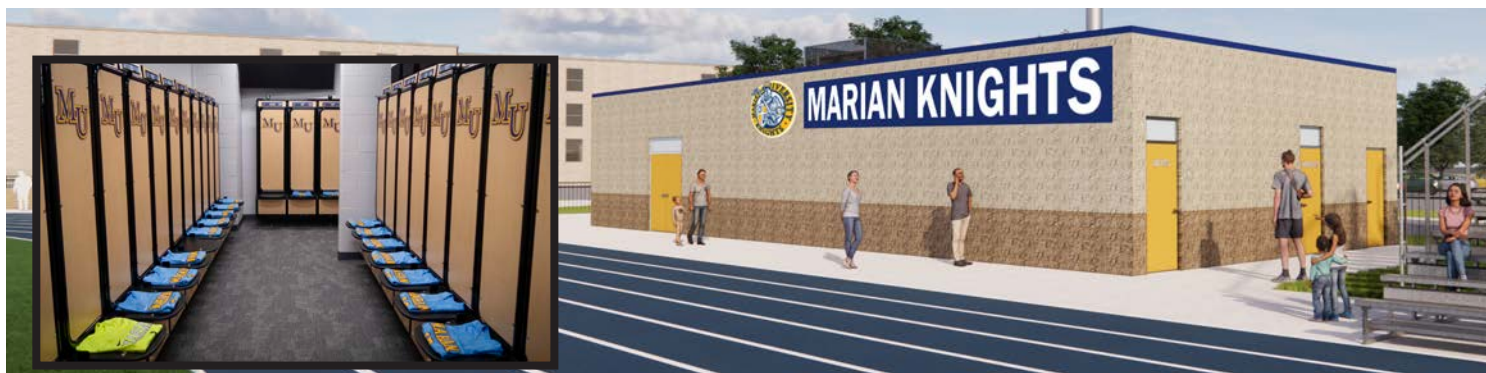
The Props family Women's Team Room opened September 14, 2024